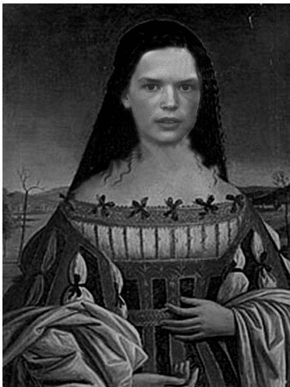
Femme fatale or troubled teenager?