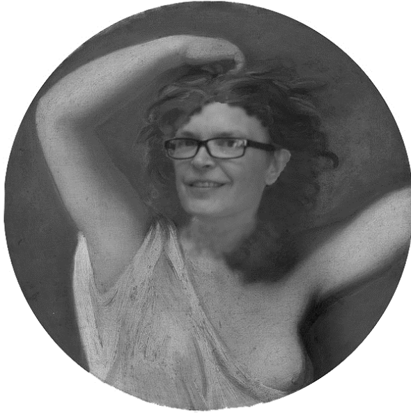
Emma, Lady Hamilton , mistress of Admiral Lord Nelson, impersonated by Rachel