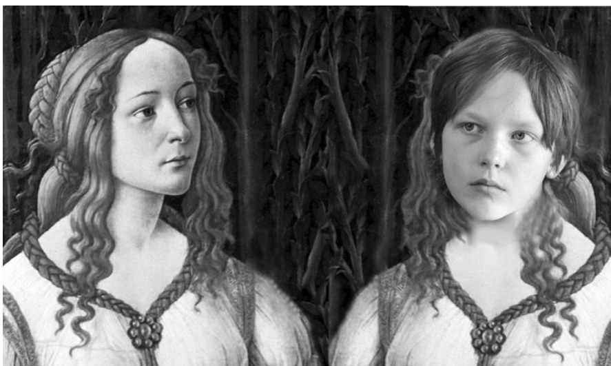
Venus and Isolde by S. Botticelli (1445-1510)