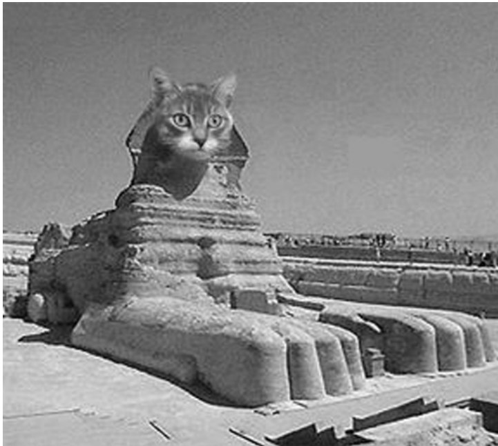
The Great Sphinx of Giza - الهول أبو