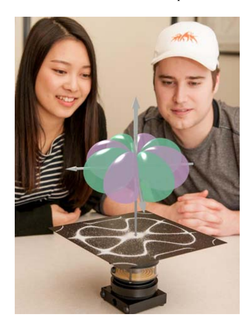
Figure 2. A Chladni figure and the corresponding visualized orbital (6g<sub>2</sub>4).

solution of a two-dimensional wave equation in cylindrical coordinates (for circular membranes) or Cartesian coordinates (for square membranes), and are shaped such that the width of the membrane fits multiples of half a wavelength (for pictures and animations of the square membrane vibrational modes, see the Partial Differential Equations app for Mathematica, by Dzamay, A.) [31]. Nodes on a circular membrane are diametric or circular, whereas nodes on square membranes can become significantly more complex. The free-edge Chladni apparatus used in this experiment has a distinct set of non-zero boundary conditions, based on the confinement of the wave to the size and rigidity of the plate, and the elastic behavior of the material. However, because of the principles of wave reflection and the symmetry of the problem, nodal curvatures in freeedge Chladni plates and attached-edge membranes are similar. The Chladni plate nodal planes discussed in the present work are also similar to the two-dimensional projections (which is a usual representation) of the nodal surfaces of hydrogen atomic orbitals. Parallels between the two systems can help drive home the wave nature of quantum mechanical particles in general, and of the electron in particular.