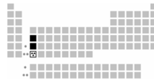
Figure 3.1 Periodic Trends, La vs. Lu