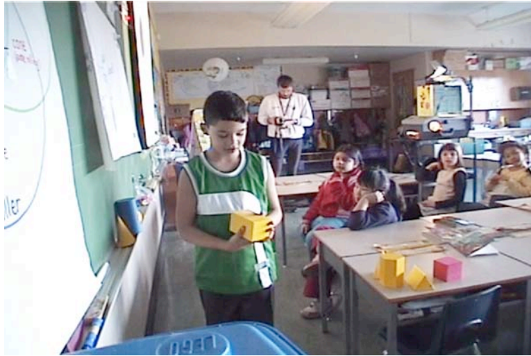
Figure 11.2. In the process of videotaping (researching) a lesson in a second-grade class.

ferred the position as (endowed) Lansdowne Chair of Applied Cognitive Sciences (University of Victoria, British Columbia). When I arrived in my new job, I found that there was little interest in the kind of work I was doing (applied cognitive science, learning science) or in the relevant courses I offered to teach. Much of the research I had done was qualitative (e.g., Figure 11.2) so that over a few years I had developed considerable competencies in a variety of qualitative methods. Thus, I took on teaching graduate course in qualitative research methods. These assignments furthered my competencies so that I became interested in writing research-based textbooks on research methods.