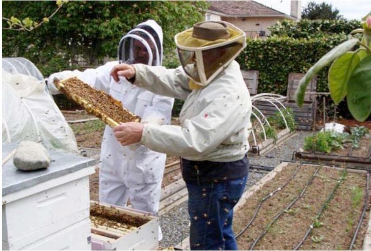
Figure 11.3. With my beekeeping mentor (right) while attending to the bees, trying to locate the queen, whose is the only egg-laying individual in the colony.

up being an assistant professor of science education. I was becoming as an academic, only to undergo another qualitative change when I was becoming a high school science teacher again. Here, I continued in the process of becoming as a physics teacher. Simultaneously, I also was becoming as a researcher, when I learned to do qualitative research while doing qualitative research—it had not been part of my doctoral training but was a possibility that arose through reading qualitative research articles in science education.