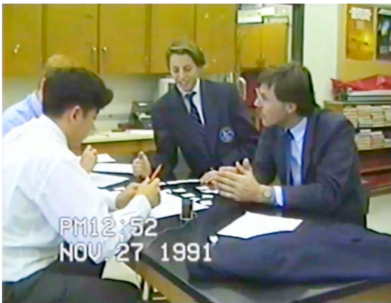
Figure 11.1. In my introductory physics course, relating with/to students in the process of producing a concept map, which I documented both to publish about and to improve upon as classroom practice..

locked at 10pm. As I refused to do so, the library-supervising teacher had to take on the job of kicking out students, who returned only 30 minutes later to continue.