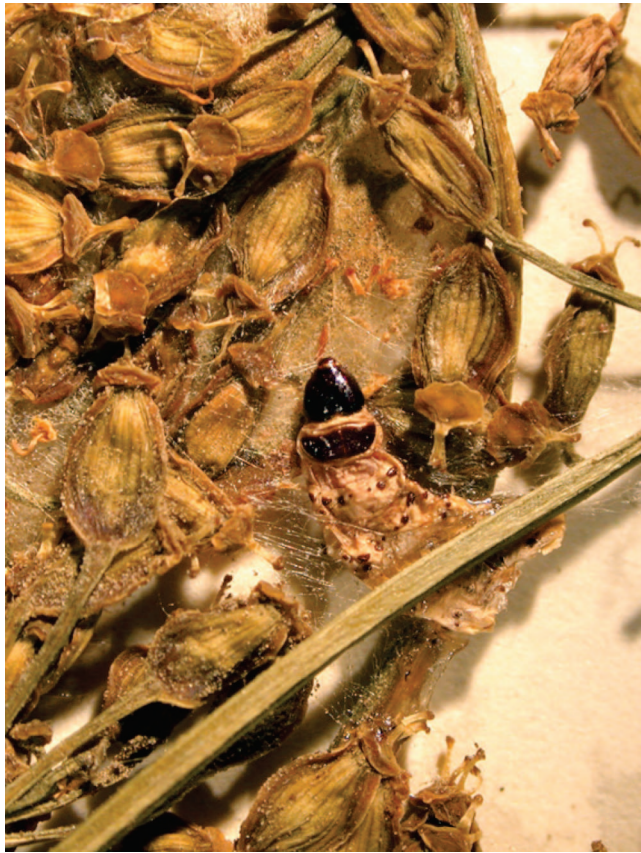
Fig. 1. Photograph of a 6-cm 2 area of an inflorescence of a P. sativa specimen collected along a railroad in McLean County, IL, by R. A. Evers in June 1958 (Illinois Natural History Survey, no. 77885). Note the presence of a larva of D. pastinacella together with its webbing. For the purposes of the survey, a specimen was scored as having been attacked by webworms if both webbing and feeding damage were present.

coumarins in P. sativa seeds are unstable over 140 years; there was no correlation between seed furanocoumarin content and time of collection. Here, we report the results of an analysis of furanocoumarin content of an extensive number of herbarium specimens of wild parsnip collected in North America over the last 152 years, spanning the period from introduction of its principal herbivore to the present, as well as collections of European specimens from the 19th century. To determine whether changes in chemistry are associated specifically with the presence of webworms, we also scored a large number of North American specimens for the presence of damage unique to parsnip webworms.