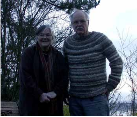
Us in bleak midwinter