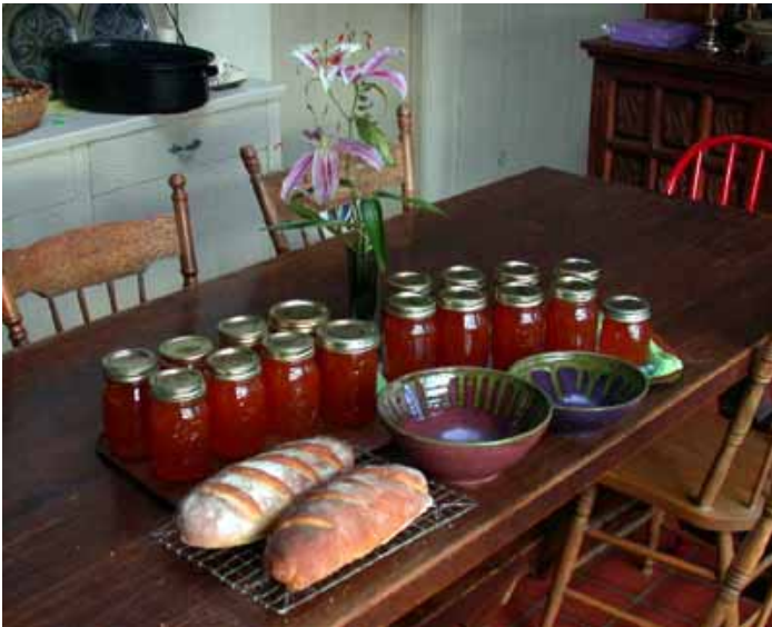
Marmalade and bread