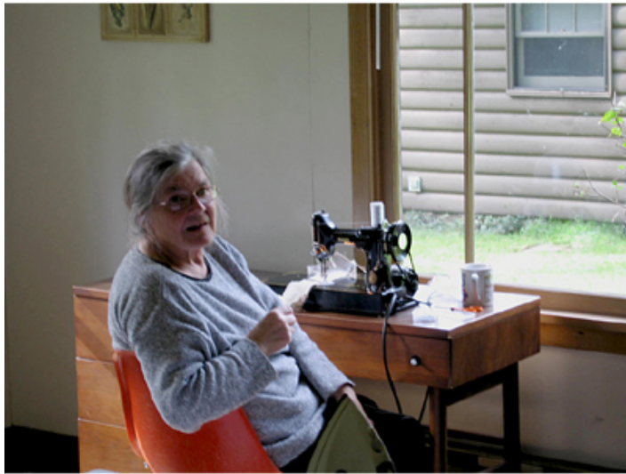
Quilting at Friday Harbor