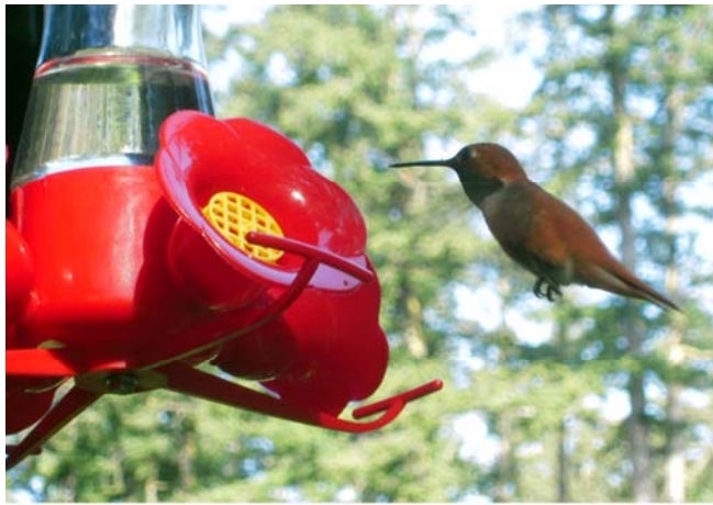
One of Rachel's hummingbird pics.