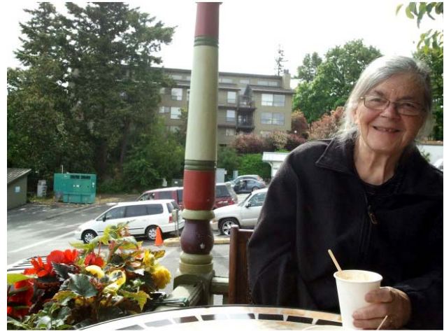
waiting for the ferry to go back to Canada

Back at home again, we had a visit from Christina who had a show coming up in Vancouver in September. Tina wanted to get big, long cedar planks for one of her pieces and had located a place out at Sooke where they still dealt exclusively with cedar. The saw mill was a fabulous place with everything from huge logs trucked in from the forest to