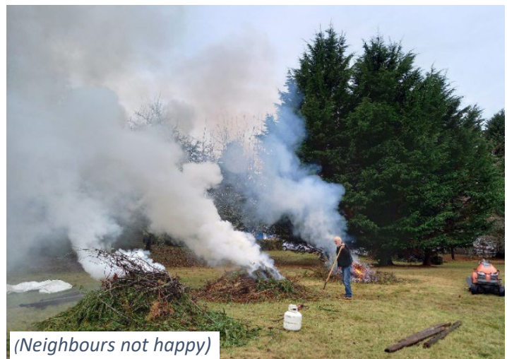
(Neighbours not happy)

Rachel came again in December and this time we spent a whole day burning the brush piles that had been building up all year.