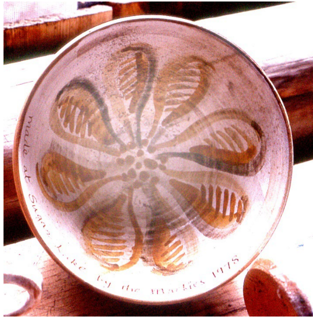
We made this bowl in the wood-fired kiln I built at Sugar Lake.