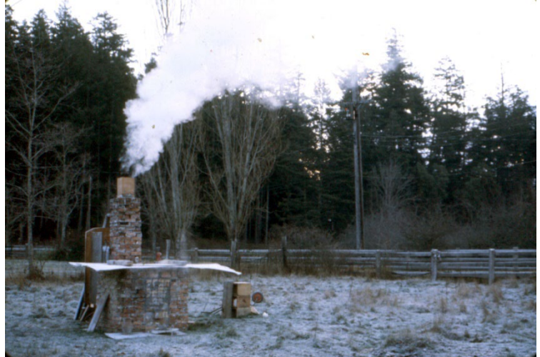
Loading, firing and unloading, helped by Quentin