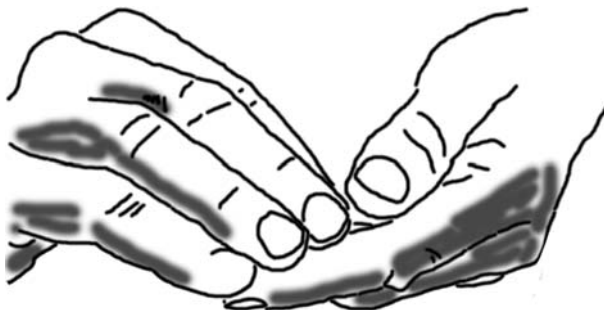
Fig. 2 Self-touching constitutes a paradigmatic case for showing how agency involves passivity

Run the fingertips of your right hand along parts of your left hand with the intention to sense its surface characteristics . Focus on sensing both the shape of what you touch and its surface characteristic. As you intently focus on getting information from the surface and its characteristic, you may notice that the sense of the left hand to be touched disappears into the background. All you feel is the surface you touch. Now continue touching with the right hand but switch your attention to the left, focusing on feeling the touch as if there was an itch that you scratched with your right hand. You notice that you can feel being touched but that what you previously have noticed with your right hand totally disappears into the background. You feel with your left hand and the right hand disappears from your consciousness.