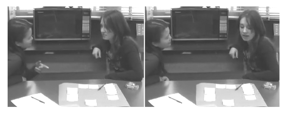
Figure 2.4. Interactions are observed at the nonverbal level, as the interviewee directs her gaze in the direction that the interviewer's deictic gesture pointed only 0.6 seconds before.

Jennifer elaborates the affirmative, "I think it'll work out actually," and, after a brief pause, adds, "I'm really excited to see if it comes through" (turn 14). Now we might be tempted to see this as a response but, with the next turn, come to evaluate