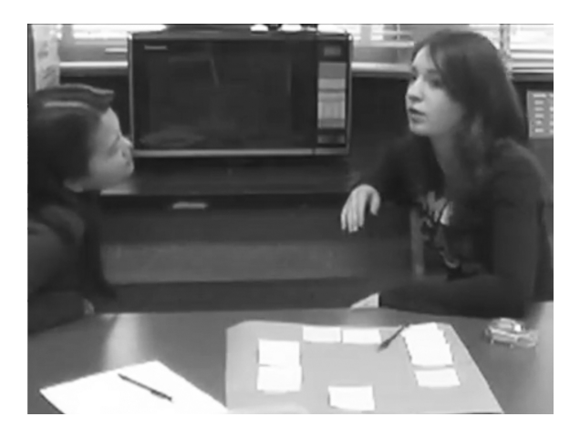
Figure 2.1. In the interview setting, the interviewer (left) and interviewee sit in plain view of each other.

contents that the unfolding narratives can take. Here I focus on how the participants pull off producing the interview as event and how they pull of producing specific content of interest to those who will analyze the interview. I use one interview episode as example to exhibit a number of different features.