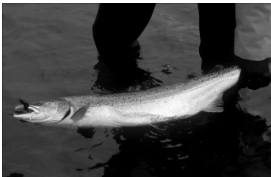
Atlantic salmon, in their native waters, are fish admired and sought after by anglers the world over and are well worth preserving. But Atlantics swimming wild in the streams of the Pacific Northwest pose dire threats to native salmonids.

2. Escapees today are healthy, high condition factor adults, reared locally, and immunized against common pathogens.