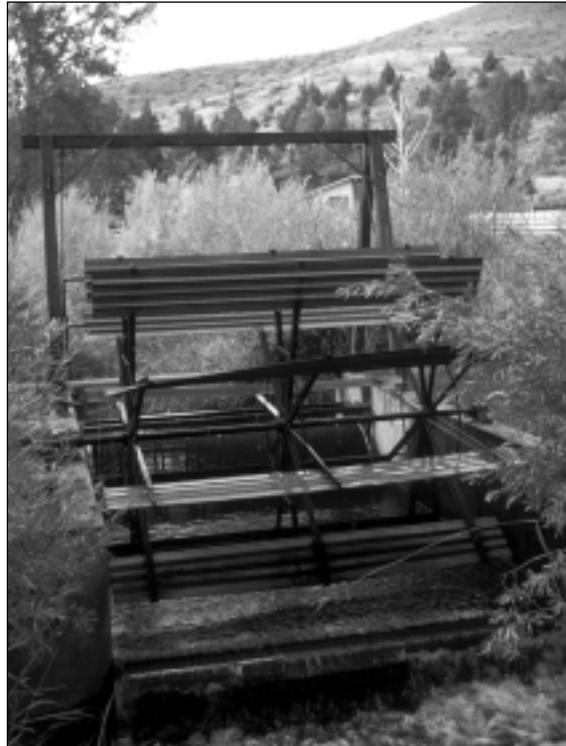
Many irrigation diversions within the Columbia River basin do not have fish screens in place, or have older screens that function poorly.

government does business, we have a problem. Sometimes it's just the result of a complex set of circumstances made possible by how these laws are written and interpreted, but still, if people perceive resource protection to be "tyrannical," we need to stop and ask ourselves why.