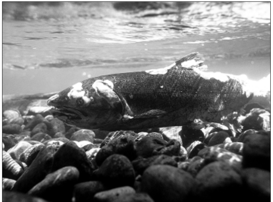
Efforts to save dwindling runs of steelhead and salmon often result in resistance from locals who may perceive them as government "tyranny" and infringements on their property rights.

Yes and no. Significant harm to the resource had to be occurring if it warranted being one of the two top priori-