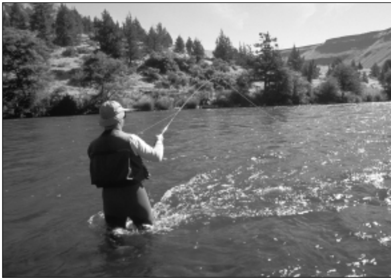
An angler fishes for summer run steelhead on Oregon's famed Deschutes River, where wild fish, hatchery fish and out-of-basin strays congregate.

numbers of newly released smolts will encourage or force other fish to migrate early. In this region the smolts from the various salmon (chinook, coho, pink, and chum), sea-run cutthroat, steelhead, and native char populations migrate downstream throughout the spring with May being the approximate peak. Collectively, in the larger systems, literally millions — and sometimes tens of millions — of smolts are produced. Clearly the native fishes have evolved over the millennia with large migrations of smolts occurring in the spring. In the North Puget Sound region, the high