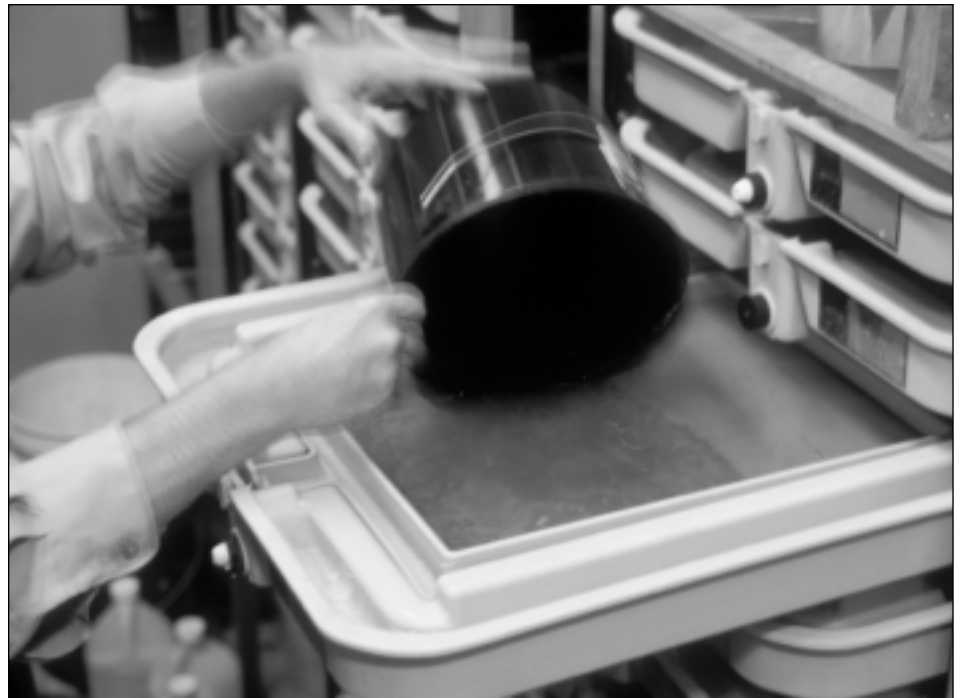
Even hatchery fish derived from wild broodstock may impart detrimental "domesticated" genes on its progeny, as well as any wild fish with which they may eventually spawn.

For recreational fisheries, the marking (typically an adipose fin clip) of hatchery production has allowed for the