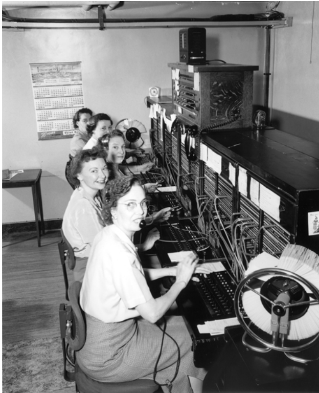
FIGURE 2. Telephone operators, Seattle, Washington, 1952.

Women's and girls' participation in some areas of American popular music in the 1950s and '60s—for example, their roles as music fans and girl-group vocalists—has been well documented. 86 But their interest in the RCA synthesizer is part of another, less well-elaborated historical trajectory: that of women and girls interested in audio technologies, electronics tinkering, and music production. 87 Indeed, women could have been a logical market for synthesizers beginning in the 1950s, in that the technology and associated techniques of the synthesizer patch, the configuration of wires that assemble component elements of a sound into one signal, was inherited from telephone operating—a profession thoroughly associated with women as a labor force and in popular culture (fig. 2). As John Durham Peters writes: “The female body hidden at the heart of a national communications network . . . is an archetypal figure. In popular culture the [telephone] operator was often treated as a heroine who, knowing