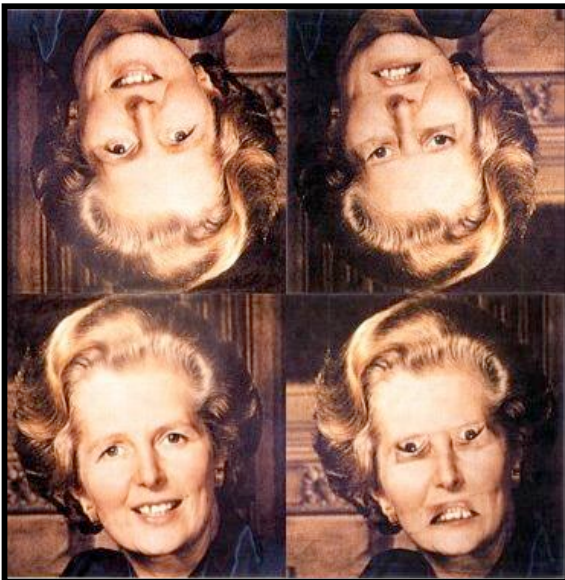
Figure 4. The Thatcher Effect. This illusion illustrates the difficulty to detect local feature changes in an inverted face. The inversion of a face challenges our configural strategy of processing facial features (e.g. the spatial arrangement of facial features).

Inversion studies suggest ASD and typically developing populations have different strategies for facial identity recognition. Virtually all visual stimuli are more difficult to recognize upside-down than right side up. Yin (67) showed that when inverted, recognition of faces is differentially impaired relative to the recognition of non-face objects (e.g., airplanes, houses). It was suggested that the inversion of a face challenges the specific strategy we use to process faces. For example, inversion challenges a configural (holistic) strategy, where the processing of the spatial arrangement of features is more important than the features themselves (see Figure 1). Object recognition, on the other hand, employs a featural approach, which is more concerned with the individual parts of an object. Featural processing is less vulnerable to inversion effects presumably because the isolated parts are more important for recognition. When viewing an inverted face, the entire configuration of features must be mentally reorganized before the face is recognized.