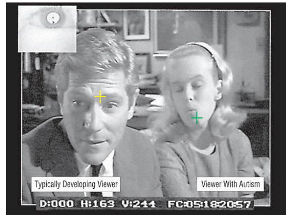
Figure 5. Klin, Jones, Schultz, Volkmar, and Cohen (33) show that a viewer with ASD and a typically developing viewer of the film "Who's Afraid of Virginia Woolf?" focus their attention on different areas of the face. While the individual with ASD spends more time looking at the mouths of people in the film, a neurotypical individual focuses on the eye region.